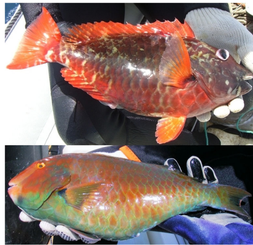
Fig. 2 Sparisoma frondosum (Agassiz 1831) specimens caught by spearfishing in 5–10 m depth, both in same area in south of Raso islet (16.61°N, 24.60°W) in Cape Verde (Eastern Atlantic). Above initial-phase spawned female (27 cm TL) captured on 27 February 2010; below terminal-phase male (32 cm TL) captured on 16 April 2011

The probable earliest mention to S. frondosum in the Cape Verde Archipelago was made by Morri et al. (2000). However, they used the name Sparisoma cf. strigatum for the specimen they recorded at Sal Island, Cape Verde, as they considered it similar to S. strigatum (Günther 1862), which is endemic to the Central Atlantic Islands of St. Helena and Ascension. In 2008, S. frondosum was observed and photographed off northern Santiago Island (IP female by P. Wirtz, CCMAR, University of Algarve, personal communication) and in August 2009 off southern Brava Island (TP male by D. Cothran, Undersea Specialist at Lindblad Expeditions, personal communication). In February 2010, a female (27 cm TL) was captured by spearfishing (Fig. 2) and in April 2011 a male (32 cm TL) was caught. Both were collected off Raso islet, in the northwest of the Cape Verde Archipelago (Fig. 1a), at depths between 5 and 10 m. Muscle tissues was preserved in 96% alcohol and sent for genetic analysis to the Department of Ecology and Evolutionary Biology of the University of California at Santa Cruz, USA. Its taxonomic identity was