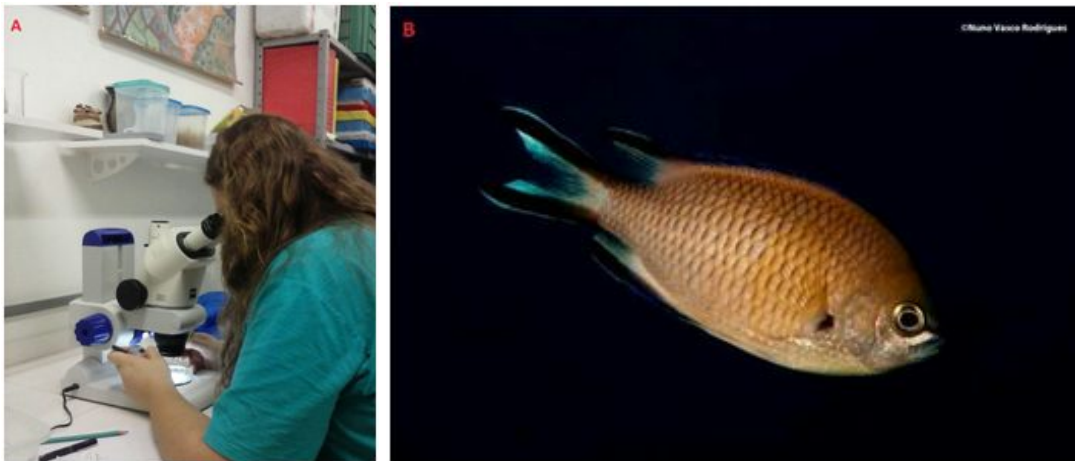
Figure 1 - A: Stomach content analyses of Chromis limbata ; B: Chromis limbata . (Photo by Nuno Vasco Rodrigues).

I am a undergraduate student of biological science studying the diet and feeding behavior of Chromis limbata , an exotic reef fish specie in Santa Catarina state (Fig1). I am also working on the restauration and maintenance of the Ichthyological Collection of Universidade Federal de Santa Catarina (UFSC).